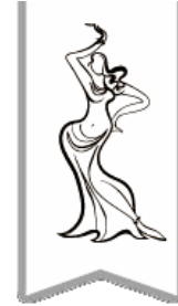
World Dance Centre logo