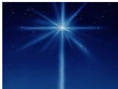
Image of star