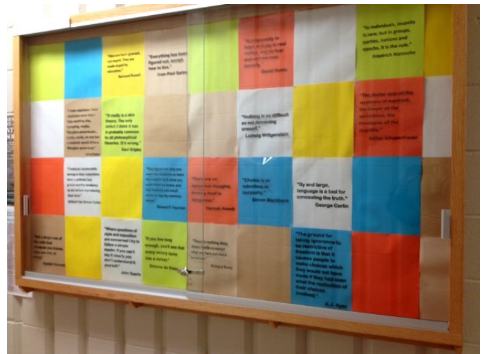
Ryan Building Third Floor - Quotable Quotes Cabinet photo