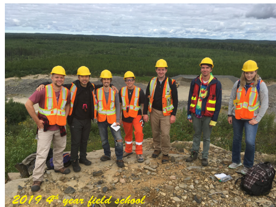
2019 4 th year field school