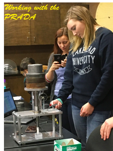
Working with the PRADA