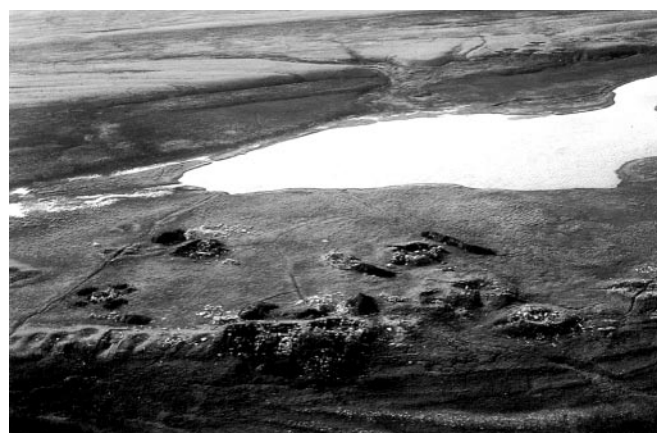
Fig. 3. Aerial view of PaJs-13 showing several excavated houses and the southern part of the cored pond. View is looking northwest.