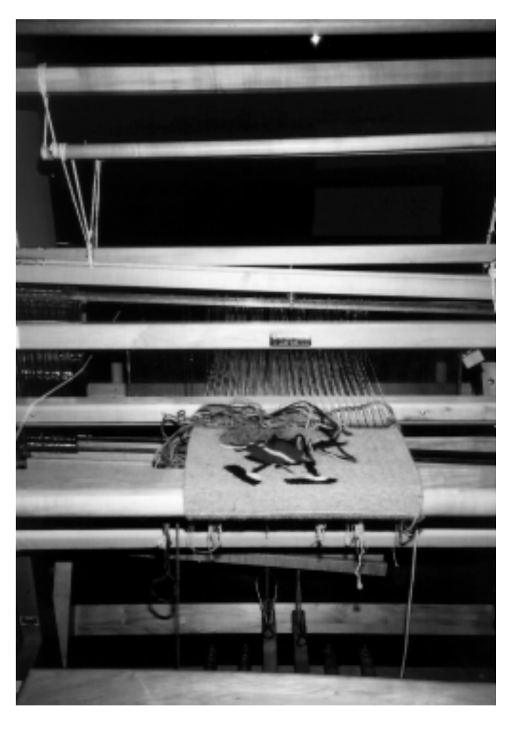
This floor loom is similar to looms used to weave fabric and shows a partially completed Drum Dancer mini-tapestry in wool and cotton. Joel Maniapik, drawing artist; Kawtysee Kakee, tapestry artist.

While every culture practises some type of textile creation like knitting, basketry, or thatching, Stuart knew that weaving was totally foreign to Inuit culture. A tapestry is, by definition, a flat-woven cloth that uses discontinuous