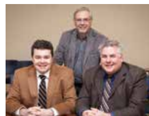
MACIVOR HARRIS LLP CLASSROOM