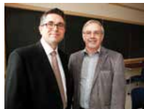
ERYOU BARRISTERS SEMINAR ROOM