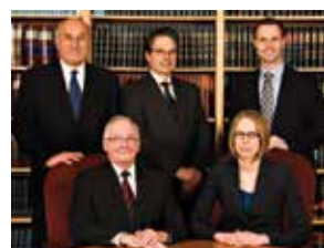
SHEWCHUK, ORMISTON, RICHARDT JOHNSON LLP COLCOVE