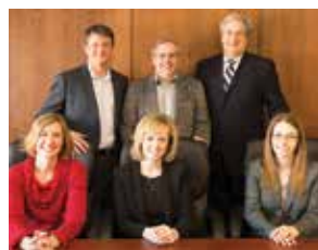
BUSET & PARTNERS LLP MOOT COURT ROOM