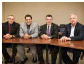
ATWOOD LABINE ARNONE MCCARTNEY LLP CLASSROOM