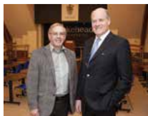
JOHN N. PATERSON LAW AUDITORIUM