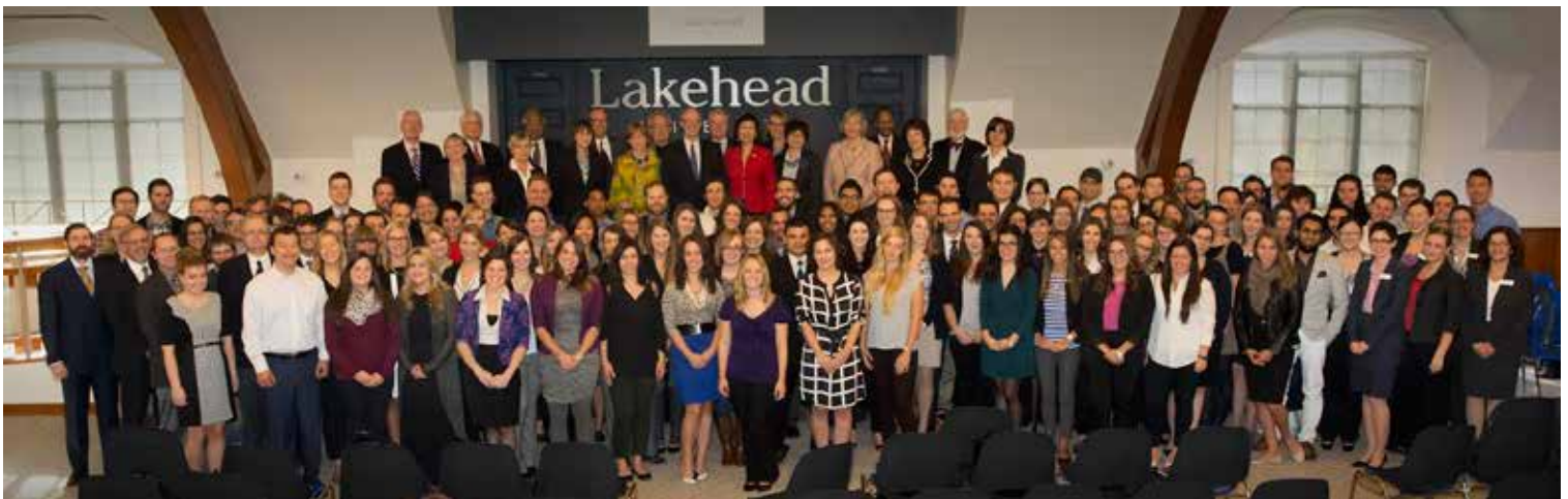
Justices of the Court of Appeal for Ontario with faculty, staff and students in the John N. Paterson Auditorium.