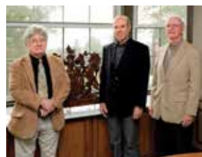
JOHN ANDREWS FOUNDATION BOARD ROOM