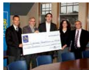
RBC INDIGENOUS LAW CLASSROOM