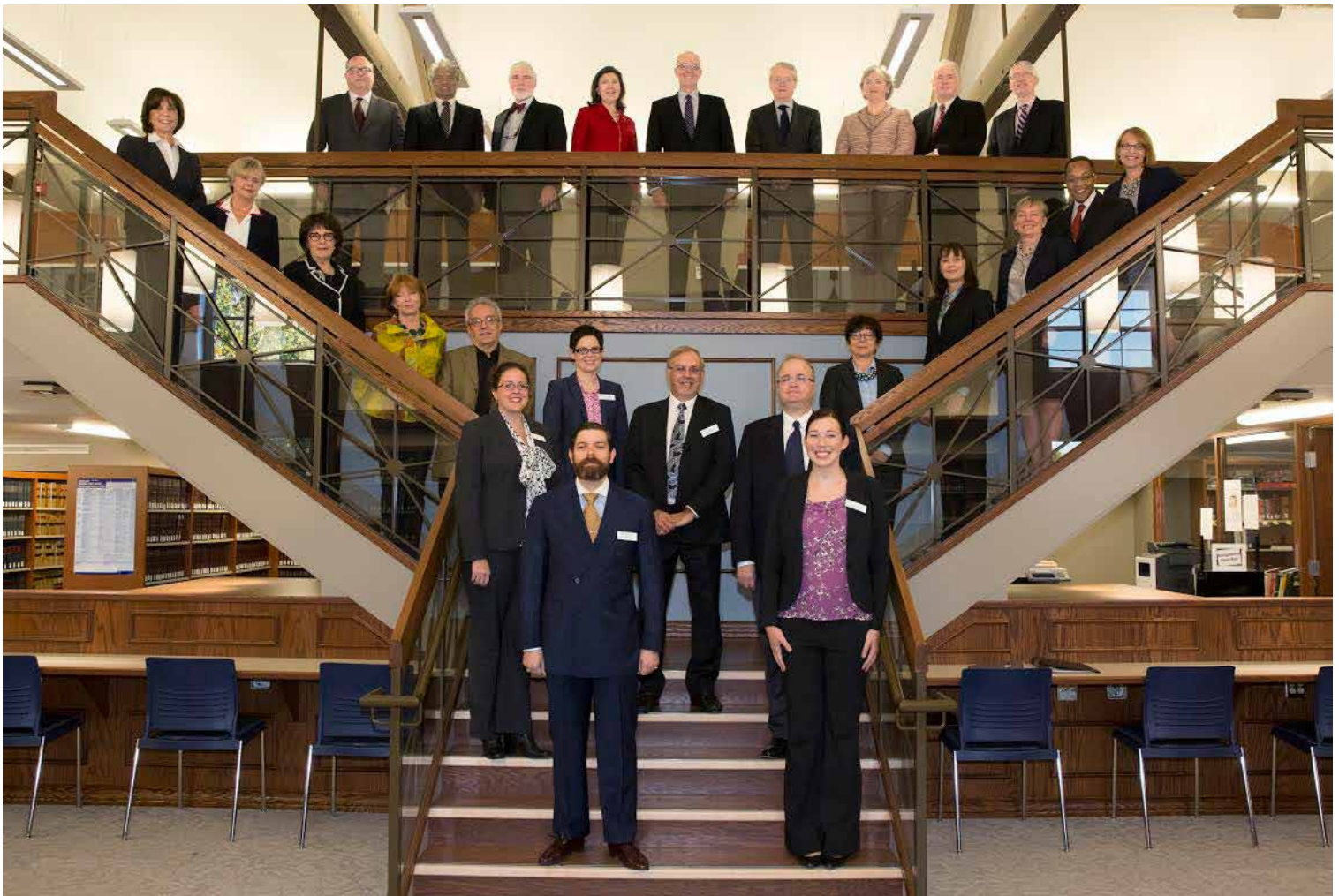
Justices of the Court of Appeal for Ontario with Faculty in the Law Library.

Students participated in Breakout Sessions on topics including Professionalism, Aboriginal Issues, Advocacy and Criminal Appeals.