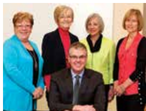
HACIO LAW SEMINAR ROOM