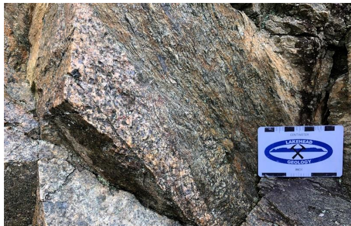
Narrow shear zone within the Sabaskong Batholith - Western Wabigoon Subprovince