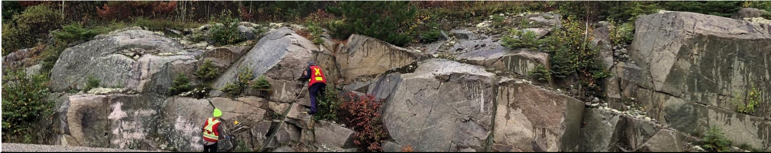
Collecting hand samples and measuring structures in the field on a rainy day. This outcrop is of the Sabaskong Batholith in the Western Wabigoon Subprovince. Examples of alteration and structure within this outcrop are shown in the bottom 3 pictures. Dana Campbell (left – sampling), Bailey Drover (right – taking measurements)