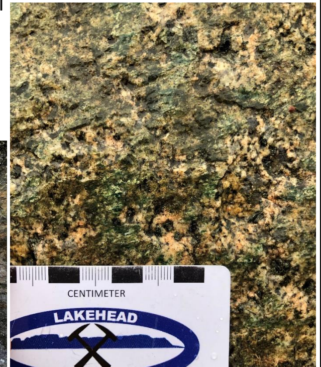
Chlorite-coated fault with slickenlines in the Sabaskong Batholith – Western Wabigoon Subprovince