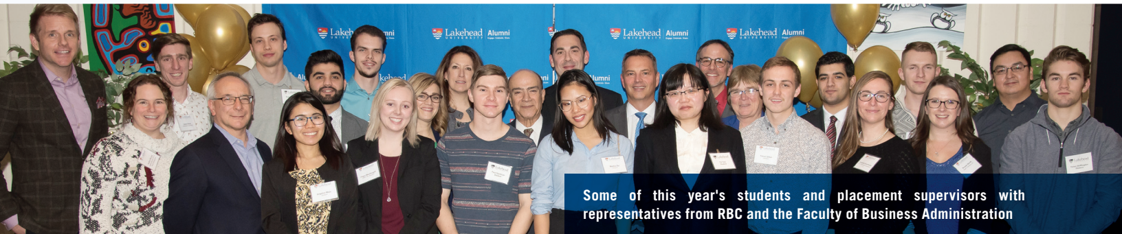
Some of this year's students and placement supervisors with representatives from RBC and the Faculty of Business Administration