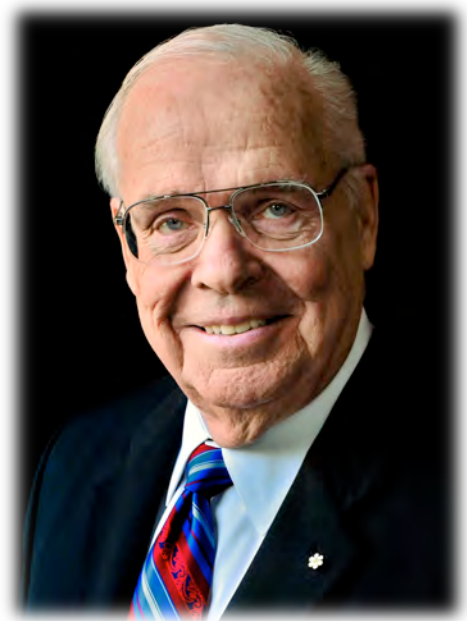
Dr. Derek Hudson Burney, O.C.

"I am personally honoured to accept this appointment and look forward to representing Lakehead University as a beacon of academic excellence in my home town," said Dr. Burney at the official announcement from Senate Chambers, January 24 th .