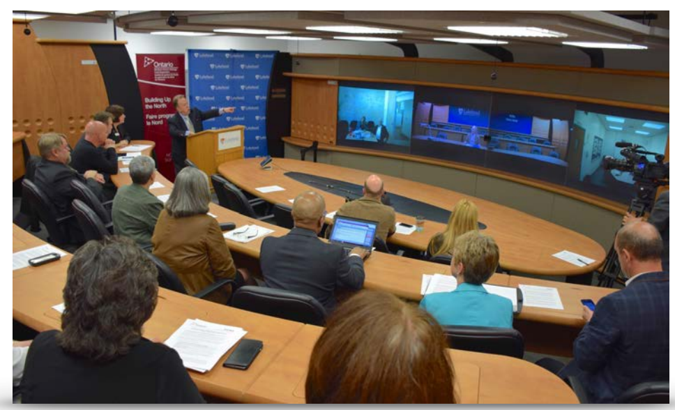
Minister Gravelle announces $1M investment to live and virtual audiences at media event.