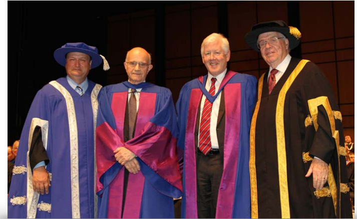
From left: Myself; Honorary Doctor of Laws recipient, The Honourable Frank Iacobucci; Honorary Doctor of Laws recipient, The Honourable Bob Rae; Lakehead Chancellor Dr. Derek Burney.