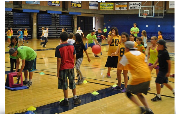
ActiveU participants play skill-building games in our Thunderdome.

Through a network of funding from the Ministry of Aboriginal Affairs and the 2015 Pan-Am Games' 'Ignite' Program, ASWCO received a grant to subsidize the ActiveU camps, including a lunch program for campers. Representatives from the Indian Friendship Centre and the Multicultural Youth Council participated in the ActiveU camps, alongside members of our Office of Aboriginal Initiatives. The project also received support from the Community Sport Councils of Ontario.