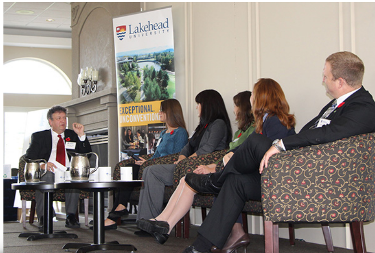
Myself speaking with Orillia donor, faculty, and students at Orillia Report to Community Luncheon.