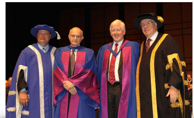
From left: Myself; Honorary Doctor of Laws recipient, The Honourable Frank Iacobucci; Honorary Doctor of Laws recipient, The Honourable Bob Rae; Lakehead Chancellor Dr. Derek Burney.