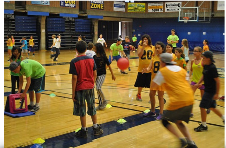
ActiveU participants play skill-building games in our Thunderdome.

Through a network of funding from the Ministry of Aboriginal Affairs and the 2015 Pan-Am Games' 'Ignite' Program, ASWCO received a grant to subsidize the ActiveU camps, including a lunch program for campers. Representatives from the Indian Friendship Centre and the Multicultural Youth Council participated in the ActiveU camps, alongside members of our Office of Aboriginal Initiatives. The project also received support from the Community Sport Councils of Ontario.