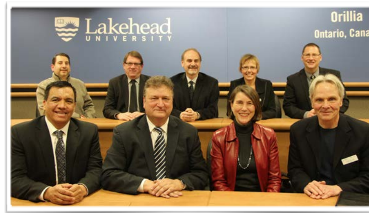
Some of PACED Simcoe's initial members (see media release for complete list).