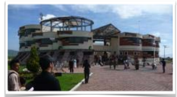
Intercultural University of the State of Mexico