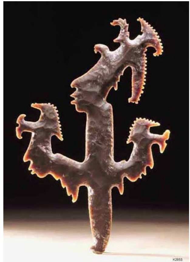
Mayan "eccentric" flint (ca. 500-900 CE) H: 23 cm. Dumbarton Oaks Research Library and Collection.

This course is a survey of world prehistory. In comparative perspective, we will take up fundamental questions concerning the origins and development of culture after the appearance of Homo sapiens . What were Ice Age hunter-gatherers like? When and why did people become farmers? Why did urban settlements develop? What beliefs and customs characterized ancient societies? These questions will be examined in the light of the archaeological records of Africa, Eurasia, and the Americas. As we shall see, archaeologists have learned a lot about the lives of our ancestors. Along the way, they have uncovered a set of fascinating stories tracing humankind's path from past to present. This course delves into these stories.