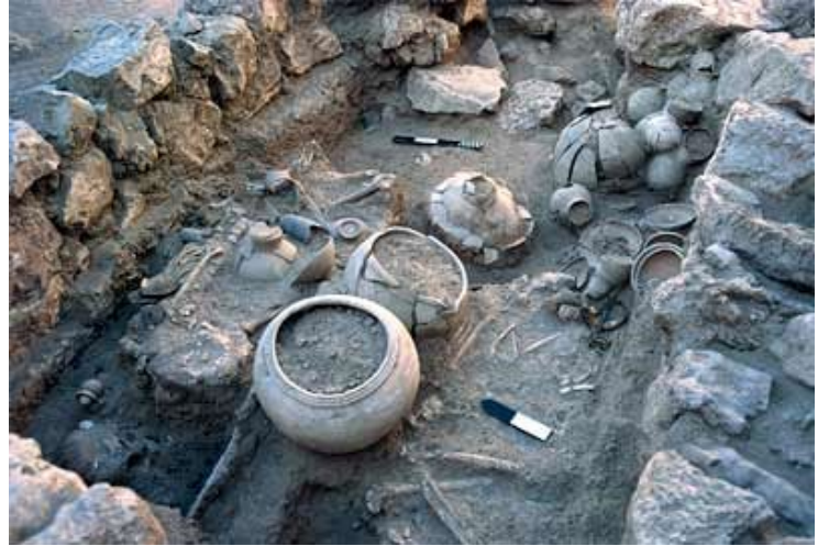
Tomb 1 at Tell Umm el-Marra, Syria, 2300 BCE. http://www.naturalhistorymag.com/htmlsite/master.html?http://www.naturalhistorymag.com/htmlsite/0507/0507_feature.html

Other materials online (see MyCourseLink>MyReadings; Other readings; and specific URLs).