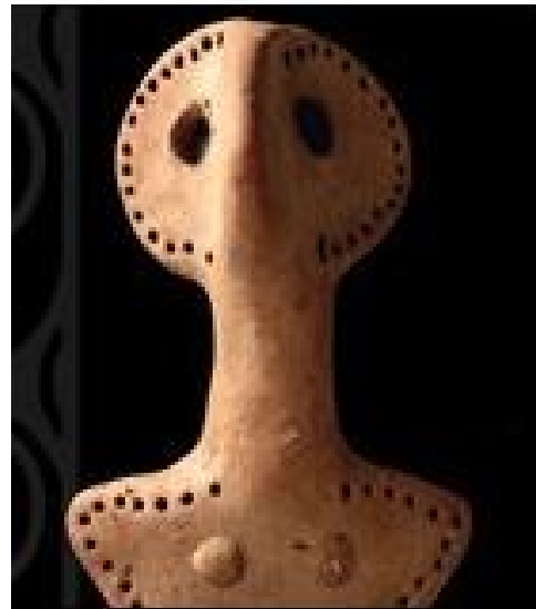
A Trypilian Neolithic figurine from Eastern Europe, 5 th MBC

http://navigator.lakeheadu.ca/~Catalog/ViewCatalog.aspx?pageid=viewcatalog&catalogid=21&topicgroupid=12715