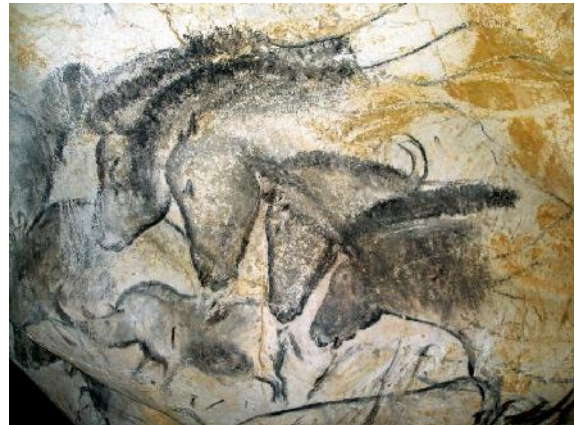
The Horse Panel, Grotte Chauvet