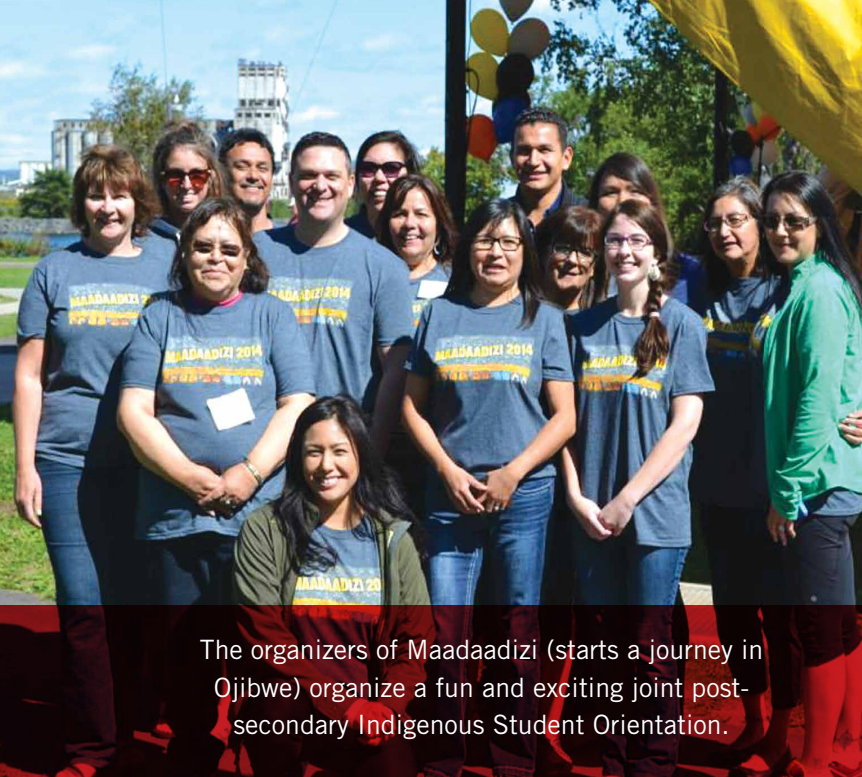
The organizers of Maadaadizi (starts a journey in Ojibwe) organize a fun and exciting joint post-secondary Indigenous Student Orientation.