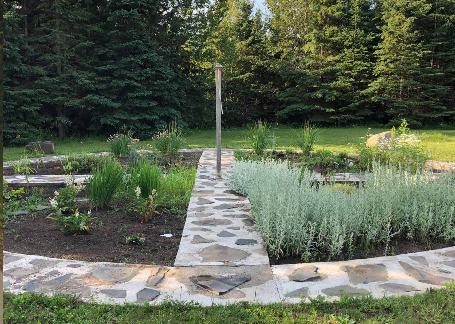
Gitigaan at sweatlodge site.