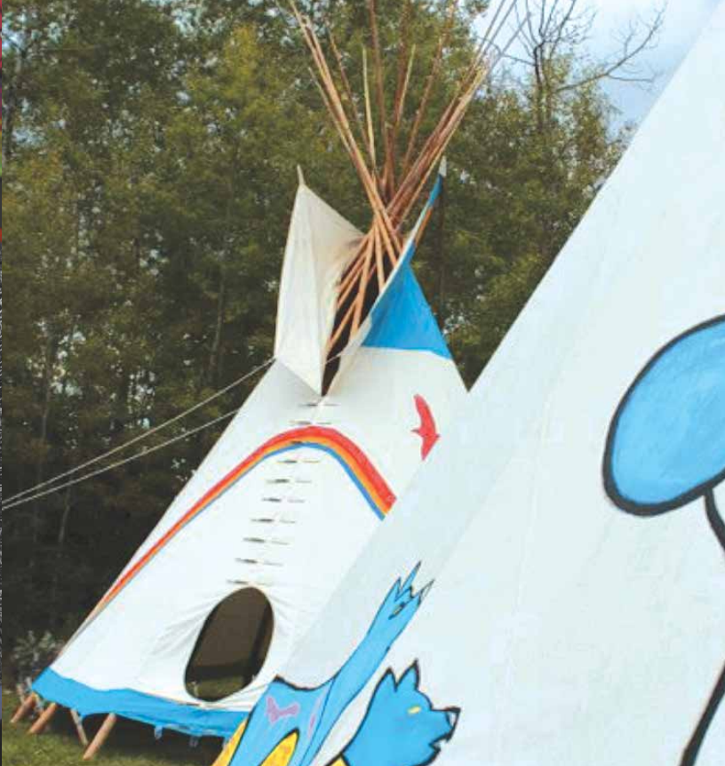
The tipis at the sweat lodge site during Fall Harvest

One of the best things about attending a smaller university like Lakehead is the level of interaction with other students and faculty. Transitioning to university can be an intimidating experience, but when you visit the Office of Indigenous Initiatives and the Indigenous Student Services Centre, you will meet Indigenous staff totally committed to your success.