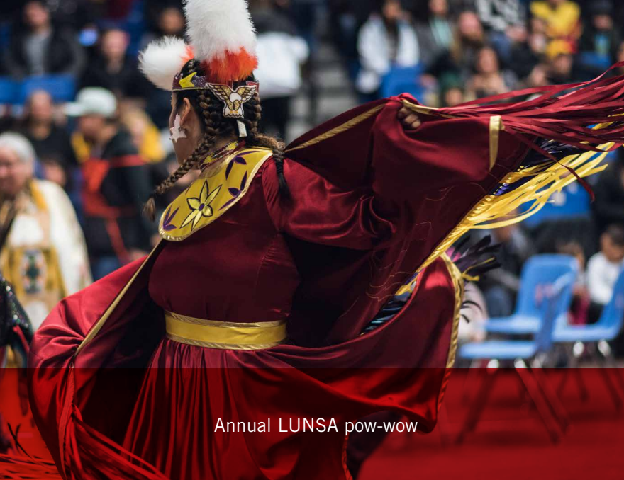
Annual LUNSA pow-wow