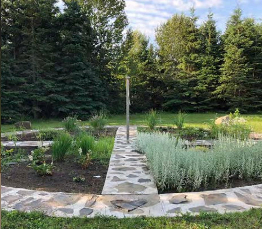
Gitigaan at sweatlodge site.