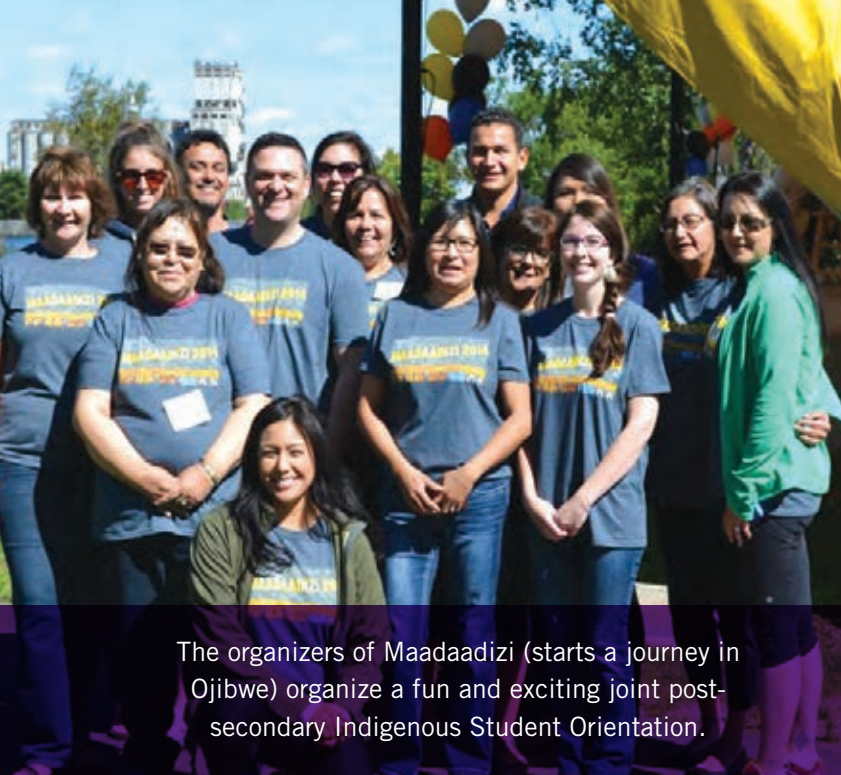
The organizers of Maadaadizi (starts a journey in Ojibwe) organize a fun and exciting joint post-secondary Indigenous Student Orientation.