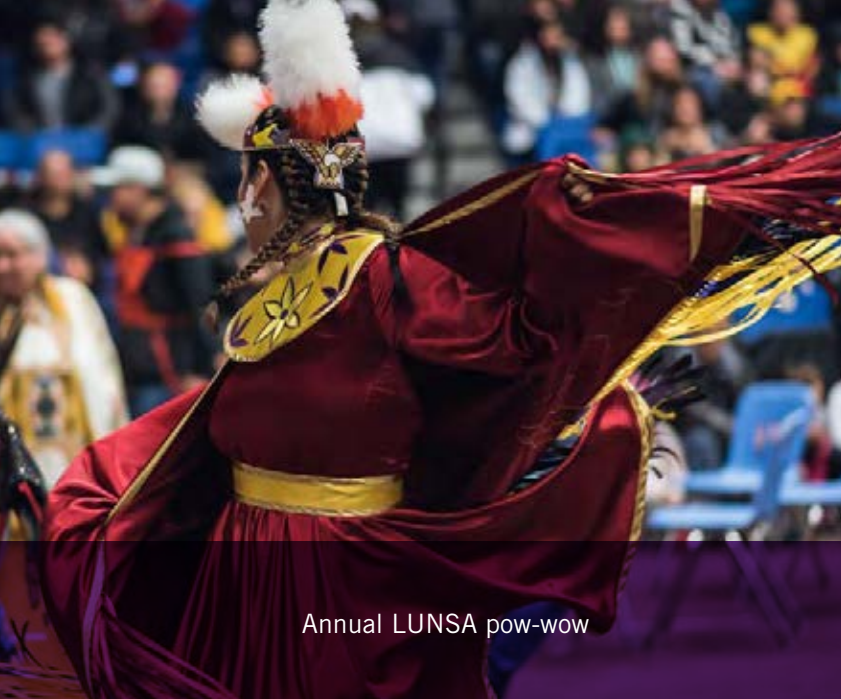
Annual LUNSA pow-wow