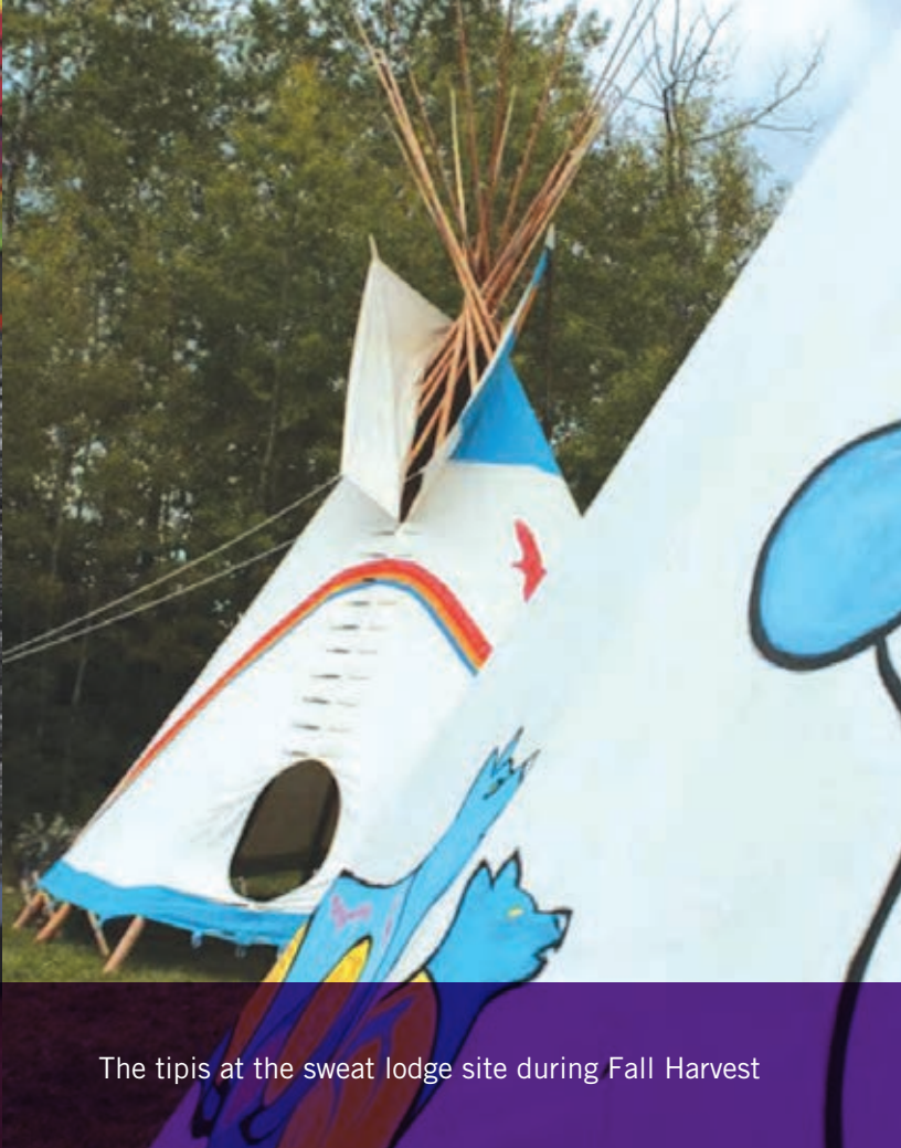
The tipis at the sweat lodge site during Fall Harvest

One of the best things about attending a smaller university like Lakehead is the level of interaction with other students and faculty. Transitioning to university can be an intimidating experience, but when you visit the Office of Indigenous Initiatives and the Indigenous Student Services Centre, you will meet Indigenous staff totally committed to your success.