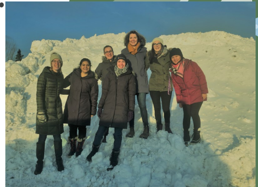
Women's Studies Collaborative Program students, 2018-19