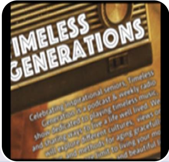
Regent Park Community