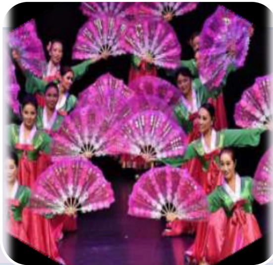
Fengcai Arts Association