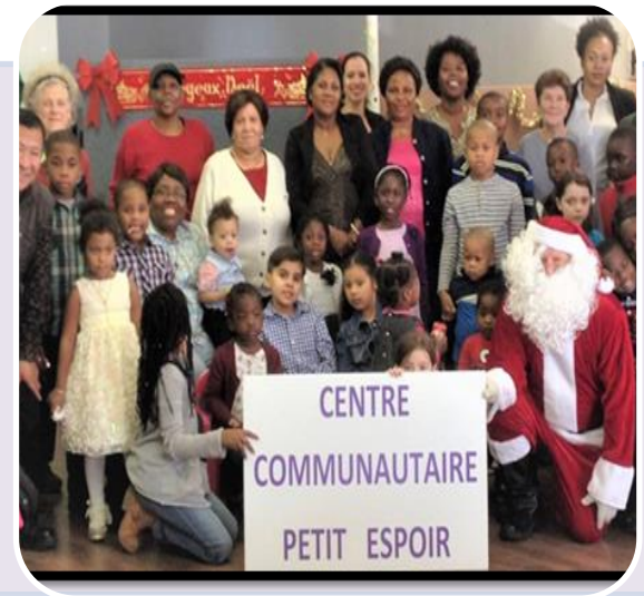
Petit Espoir Community Centre