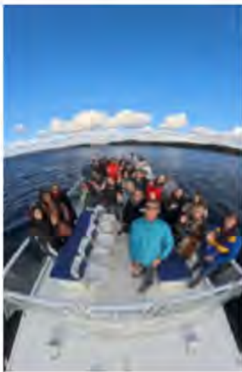
Photo: Fall Colour Boat Cruise, Oct. 26

Lakehead University's Orillia Homecoming 2024 offered a vibrant lineup of events that brought together alumni, students, and their families for a memorable weekend of connection and celebration. The festivities kicked off on Friday with Family Night at the Barrie Sunset Drive-In, featuring a double feature movie, engaging games, and exciting prizes for attendees.