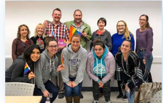
4th year INTD Research Capstone in Social Justice students with speakers from Barrie Pride.