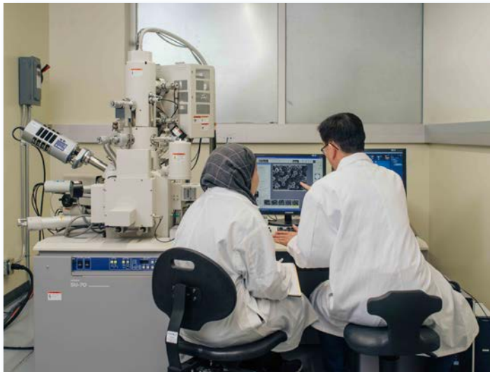
Transmission Electron Microscope (TEM)

Funding from the Federal Government of Canada and the Province of Ontario have also been confirmed for the purchase of a Nuclear Magnetic Resonance Spectroscopy (NMR).