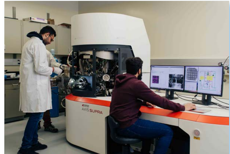
X-Ray Photoelectron Spectroscopy (XPS)