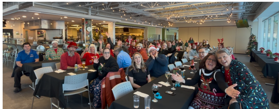
Members of the Orillia campus community.