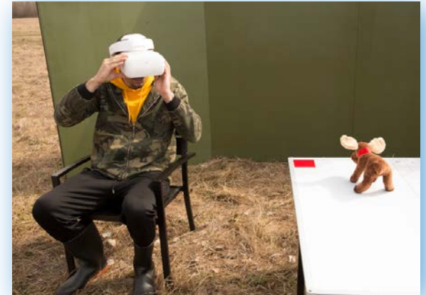
Amazing Race Canada racer participates in Lakehead University-designed challenge.