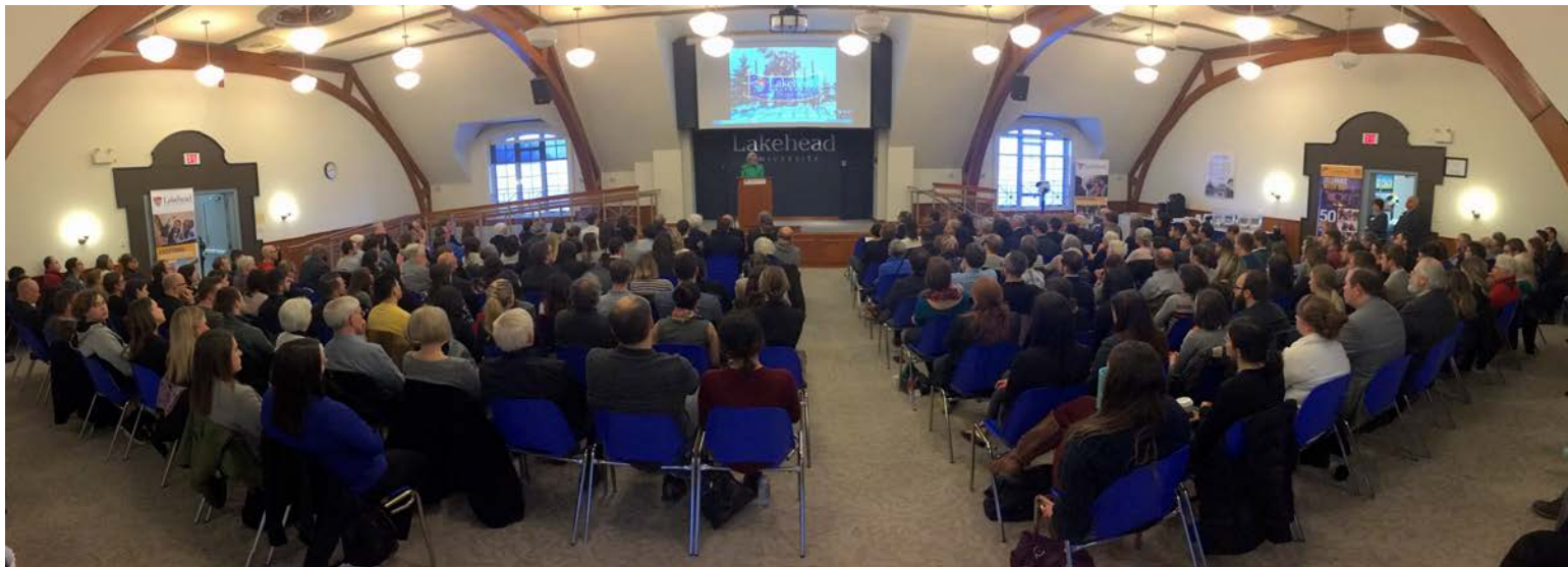
Chief Justice Beverley McLachlin speaks to a capacity crowd at John N. Paterson Faculty of Law Auditorium.

More than 280 people registered for the live-streamed event that included the Chief Justice taking questions from the crowd and plenty of photo opportunities.