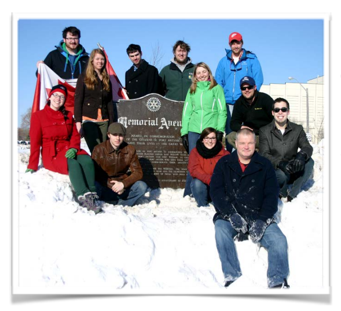
Graduates of Lakehead University's Humanities 101 program gathered for a convocation dinner and celebration.