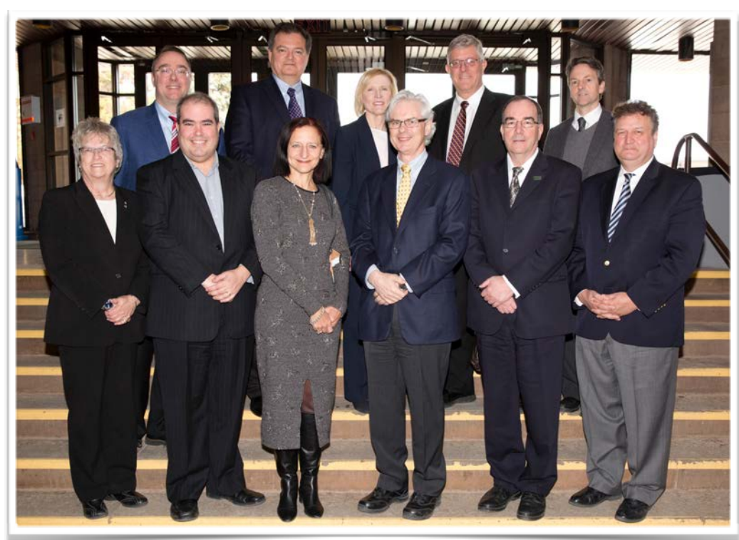
Ontario university presidents gather at Lakehead University's Thunder Bay campus.