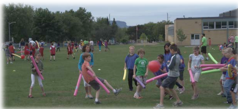
Students play at ActiveU's launch event in Thunder Bay (June 2012).

During the 2012/2013 year, the Achievement Program has made progress in program development and eligibility. Currently there are thirteen students enrolled from Lakehead Public Schools and joining us shortly will be an additional thirty-five students. An ActiveU day on campus session is scheduled for May in which the forty-eight students will participate in activities to earn tuition credits. The beginning phases of a Memorandum of Understanding is underway with the Keewatin Patricia District School Board and the Thunder Bay Catholic District School Board.