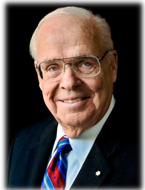
Dr. Derek Hudson Burney, O.C.

"I am personally honoured to accept this appointment and look forward to representing Lakehead University as a beacon of academic excellence in my home town," said Dr. Burney at the official announcement from Senate Chambers, January 24 th .