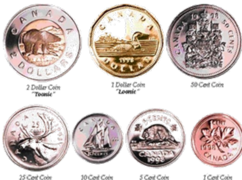
Examples of Canadian Coins