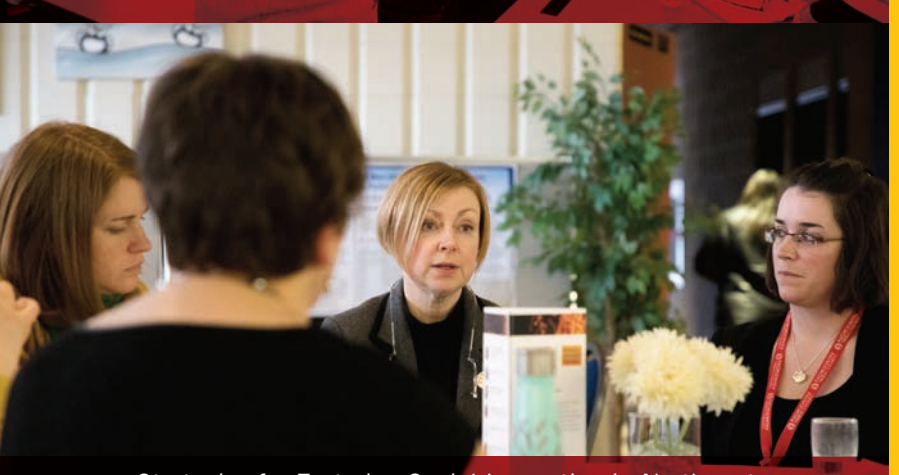
Strategies for Fostering Social Innovation in Northwestern Ontario: A Community-University Research Conversation.