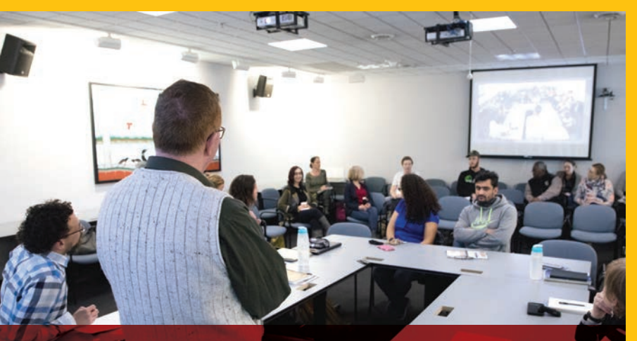
Panel: Agrobiodiversity to Sustain Community Food Systems.