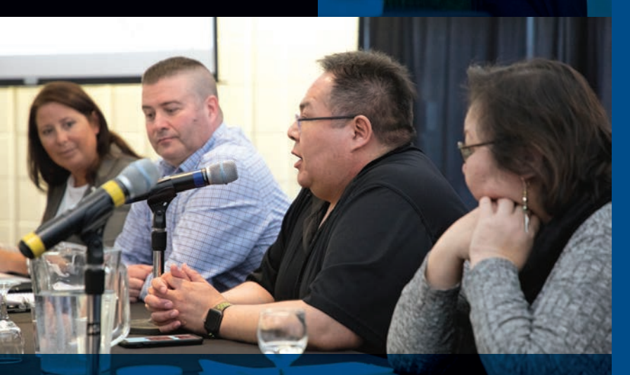
Strengthening Partnerships with Northern Aboriginal Institutes: This event explored the rich history of the Aboriginal/Indigenous Institutes in Ontario through a round table discussion regarding the vision of post-secondary education in Ontario.